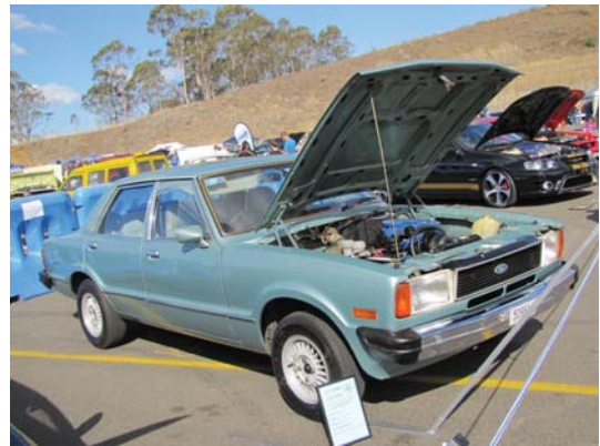
Greg Boscato - TE Cortina Preservation Classic